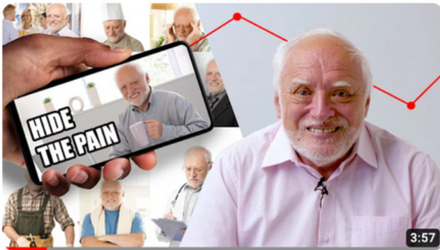
I Accidentally Became A Meme: Hide The Pain Harold