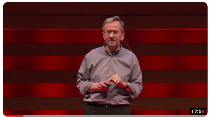
From cave drawings to emojis: Communication comes full circle | Marcel Danesi | TEDxToronto

CONSIDER any new learning or insights you have after viewing these clips