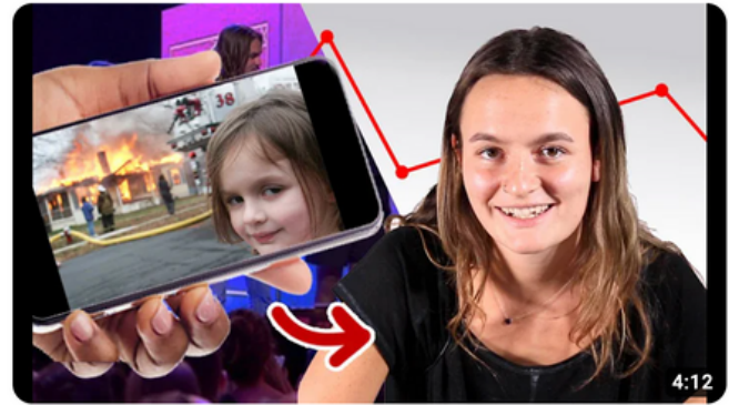
I Accidentally Became A Meme: Disaster Girl

(RE)CONSTRUCT a meme by taking an existing negative meme and changing it to be positive and uplifting OR by creating a new meme.