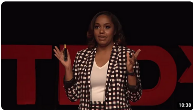
Emoji: The Language of the Future | Tracey Pickett | TEDxGreenville